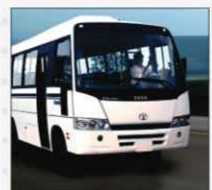
24 X 7 TRANSPORTATION